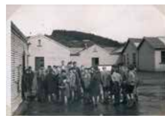
Sedgley Boys Home, Upper Hutt, NZ